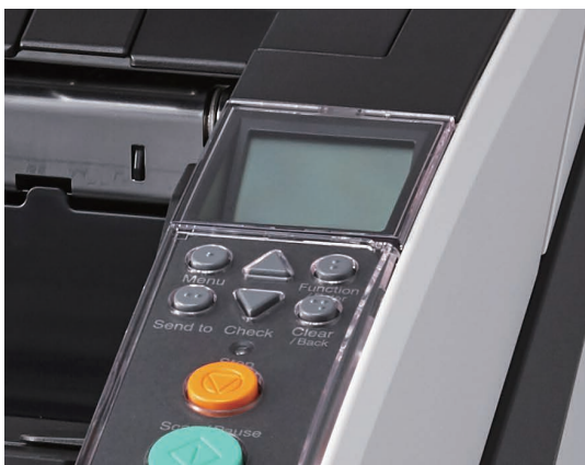
Integrated LCD operating panel

Ricoh's fi-7800 and fi-7900 deliver the complete scanning solution. A combination of our market-leading scanner, software and service give you everything needed for a more productive system and more productive people, allowing you to focus more on your business and less on your technology.